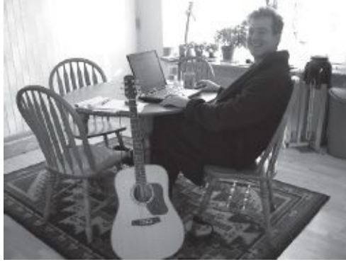
Opening the launch in my bathrobe at the kitchen table.

In fact, I did this launch from my kitchen table while I was in my bathrobe. Here's a photo my wife took just a few moments after we opened the shopping cart.